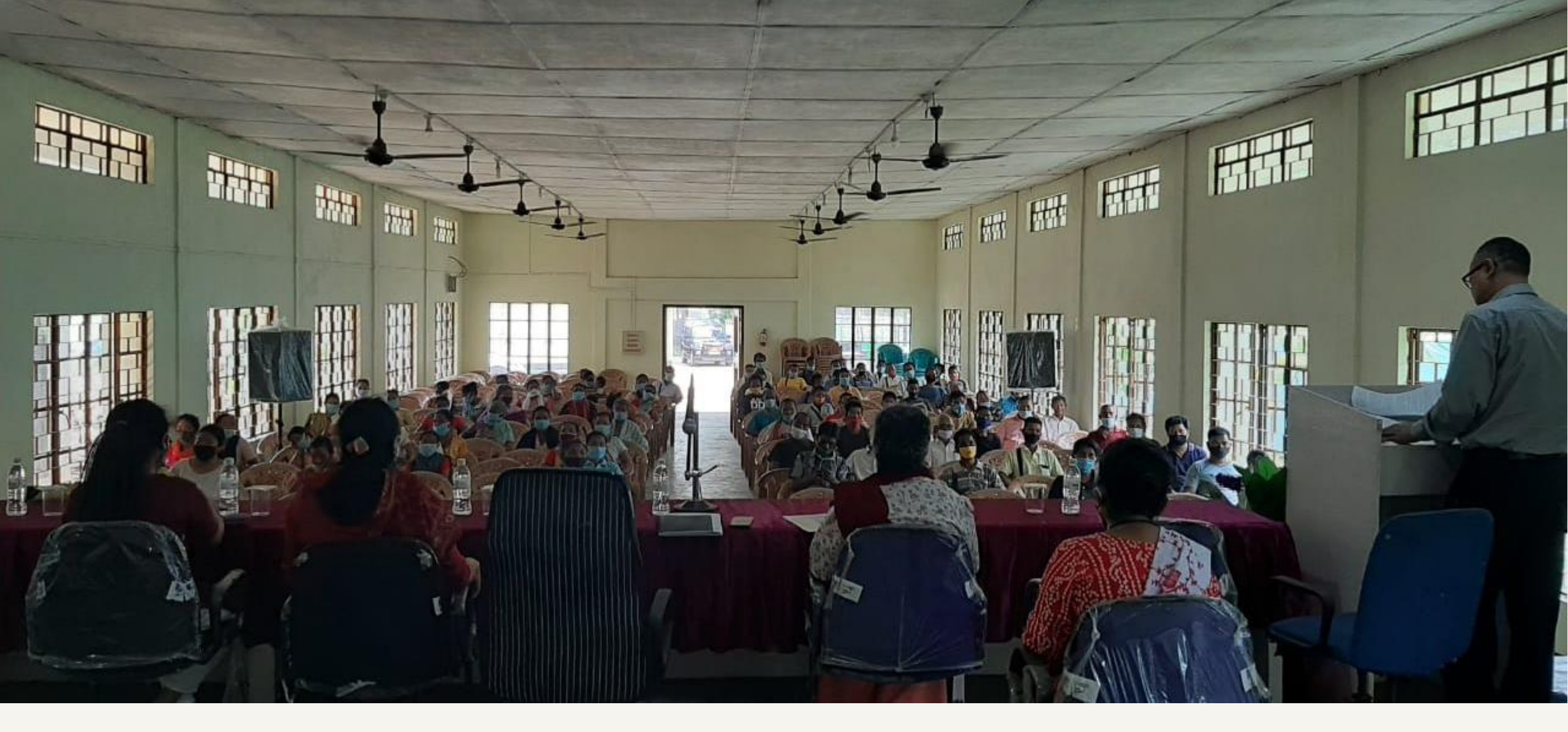
IMAGE 6: MOTIVATIONAL ADDRESS TO CLUSTER FARMER MEMBERS BY DC, NGH