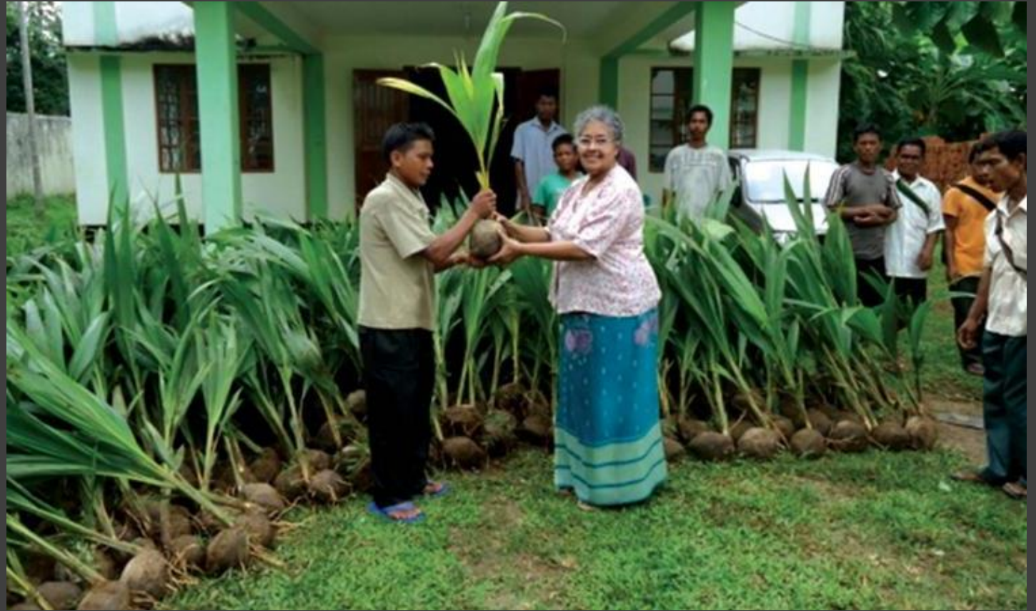
COCONUT PLANT DISTRIBUTION