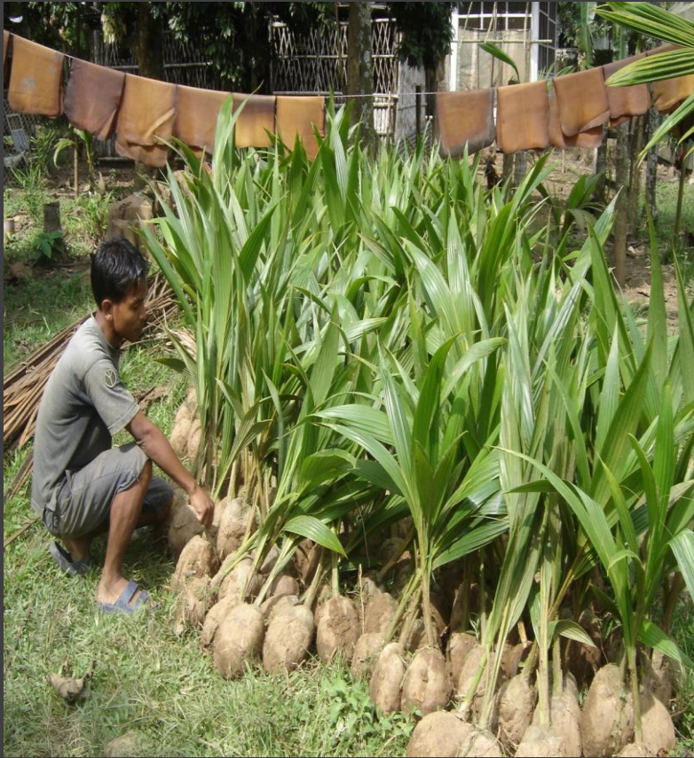
COCONUT PLANTS PROCURED FROM NURSERY FOR DISTRIBUTION