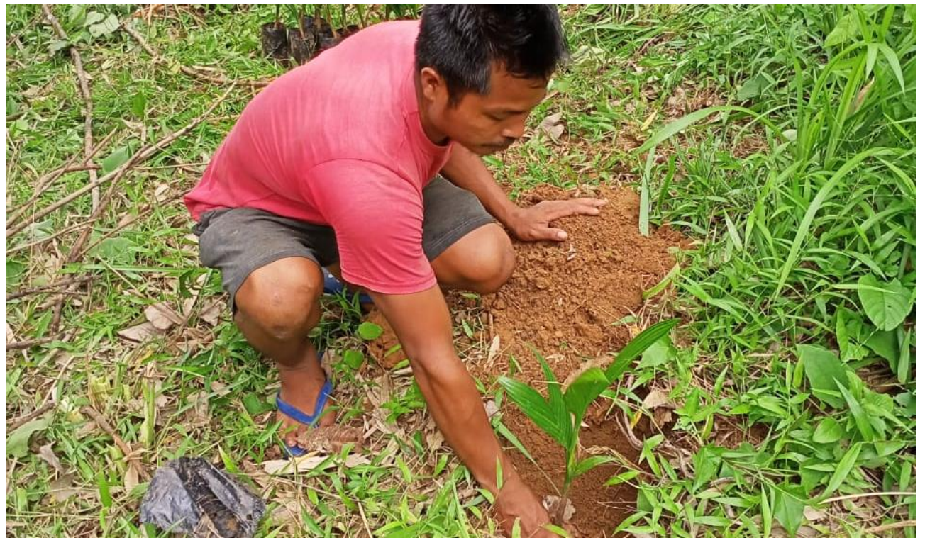
TURMERIC SAPLING PLANTED