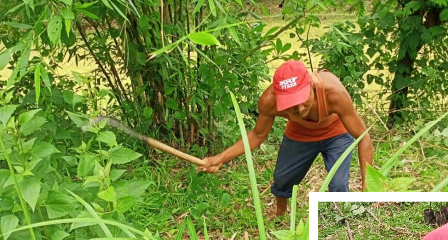
CLEANING OF THE AREA